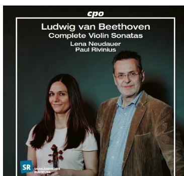
Above: Box Cover | Below: Booklet Cover